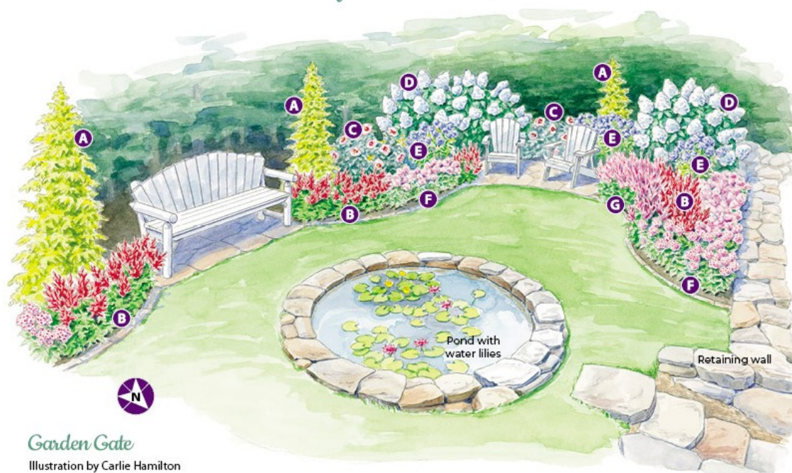
Colorful border around a water feature and seating areas.

Beautiful retreats feature cozy and quiet seating areas, fragrant and soothing colors, or exciting colorful plantings, and sometimes a small water feature. Colorful plantings attract birds, bees, hummingbirds and butterflies.